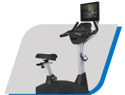
OPTIONAL TV BRACKET (TV NOT INCLUDED)

The CU800 was specifically engineered for the commercial environment, from its heavy-duty steel frame to its durable powder coat paint finish. The design focuses on convenience, comfort, and durability. The console offers multiple programs, most with 40 levels of resistance and enough feedback information to make sure your clients never grow bored of the CU800. The extra-smooth ride comes from the perfect gearing and the integrated generator/flywheel system.